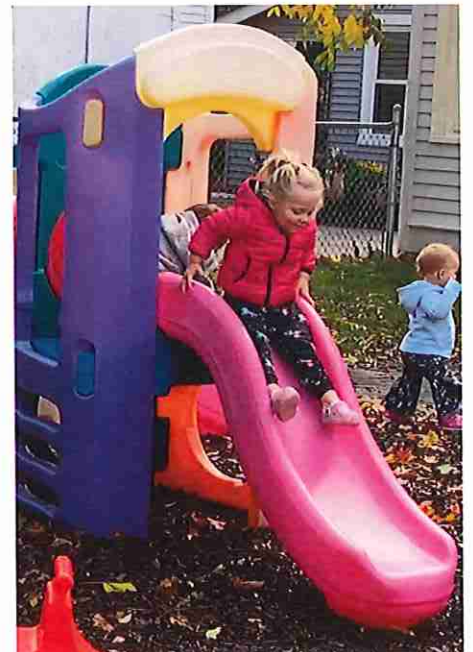
Sliding into autumn fun on our new Early Childhood Program playground!