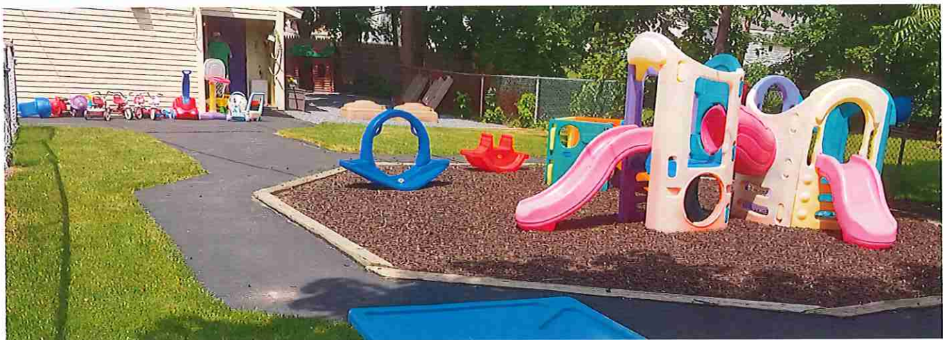
Early Childhood Playground: New walkway, cushioning & grass!